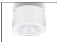
TA344 Opal polycarbonate