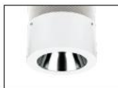
TA340 Clear glass