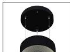
/SUS 2 m suspension kit in black