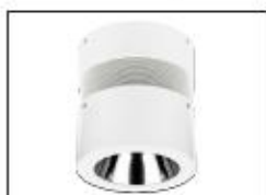
/WWW White finish