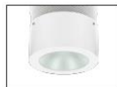
TA342 Fully etched glass