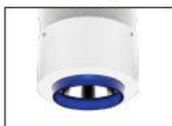
TA310/BLUE Blue vertical halo