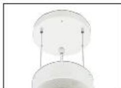
/SUS 2 m suspension kit in white