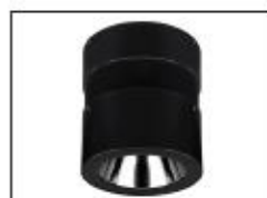
/BBB Black finish