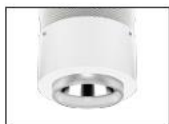
TA310/FROST Frosted vertical halo