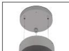
/SUS 2 m suspension kit in grey