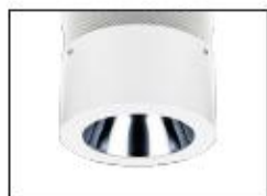
TA343 Clear polycarbonate