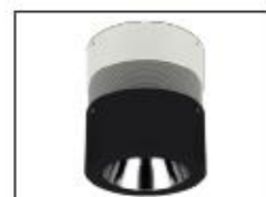
Example: /WGB White, grey, black