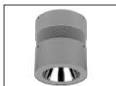
/GGG Grey finish