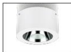
TA341 Centre etched glass