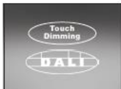
T+DALI Touch dimming / DALI