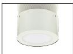
TA344 Opal polycarbonate