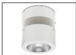
/WWW White finish