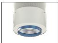
TA310/BLUE Blue vertical halo