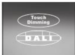
T+DALI Touch dimming / DALI