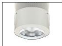
TA310/FROST Frosted vertical halo