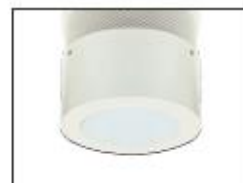
TA342 Fully etched glass