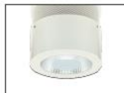
TA341 Centre etched glass