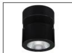
/BBB Black finish