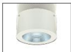
TA343 Clear polycarbonate