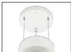
/SUS 2 m suspension kit in white