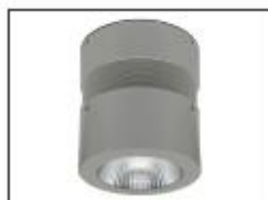
/GGG Grey finish