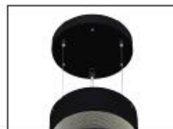
/SUS 2 m suspension kit in black