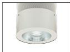
TA340 Clear glass