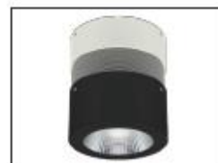
Example: /WGB White, grey, black