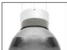
/WW White finish