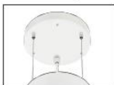
94.SUS/5M/3C 5 m fixed output suspension kit