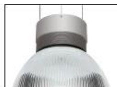
/GG Grey finish