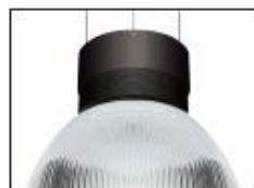
/BB Black finish