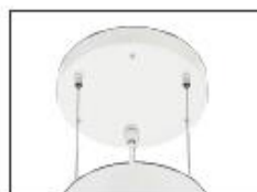
94.SUS/5M/5C 5 m T+DALI suspension kit