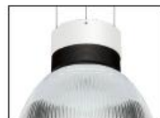
Example: /WB White, Black