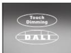
T+DALI Touch dimming / DALI