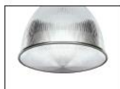
/4700 Conical lens complete with clamp band