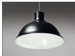
/B Black satin outer, white satin inner