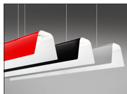
Linear LED pendants available Please see ABG datasheet