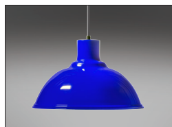
Product variations Other colours and specifications available on request