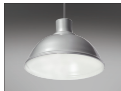
/G Grey satin outer, white satin inner