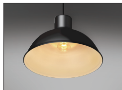
ABF003 Warm dim (E27)