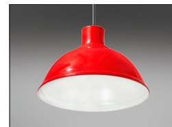
/R Red gloss outer, white satin inner