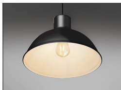
ABF002 Fixed output (E27)