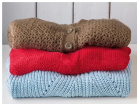
XICATO® Artist Series High definition color designed for museums, galleries and hospitality.