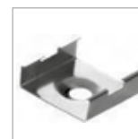
A39123.CLI Clips inox