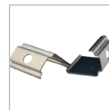
A39134.CLP Clip Inox