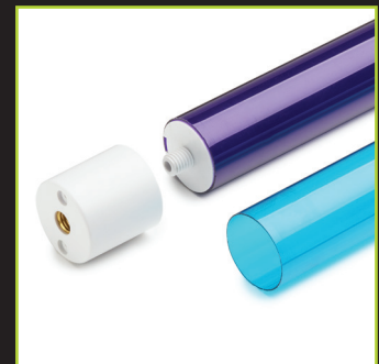
DDP Coloured Sleeves