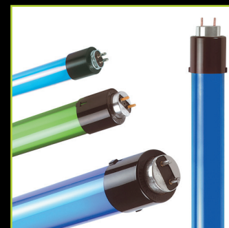
Coloured over sleeves