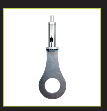
Tear Drop Suspension Kit