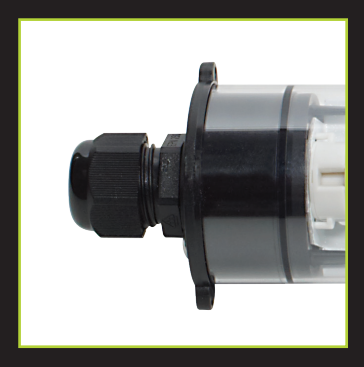
Black End Cap

Not suitable for permanent submersion, do not dim in temperatures below +10°C use LED version.