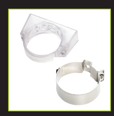
Plastic & Stainless Steel Clamps